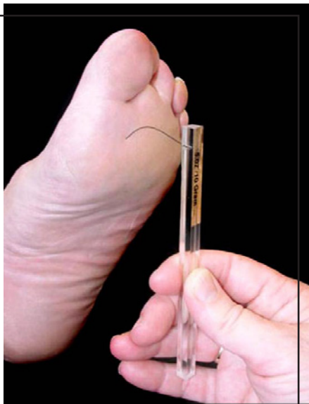
Diabetic Foot Screen

PHOTO: Katia Langton, DC, CPed/ Lower Extremity Amputation Prevention